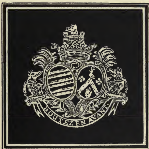
LA COMTESSE DU BARRY.